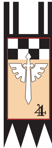
The Banner of the 4th Company