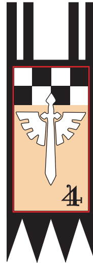
The Banner of the 4th Company