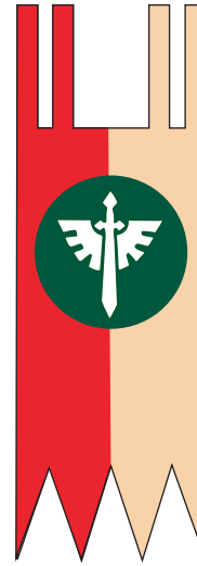
Current [Home-World Pattern]