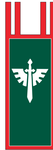
Current [Chapter Pattern]